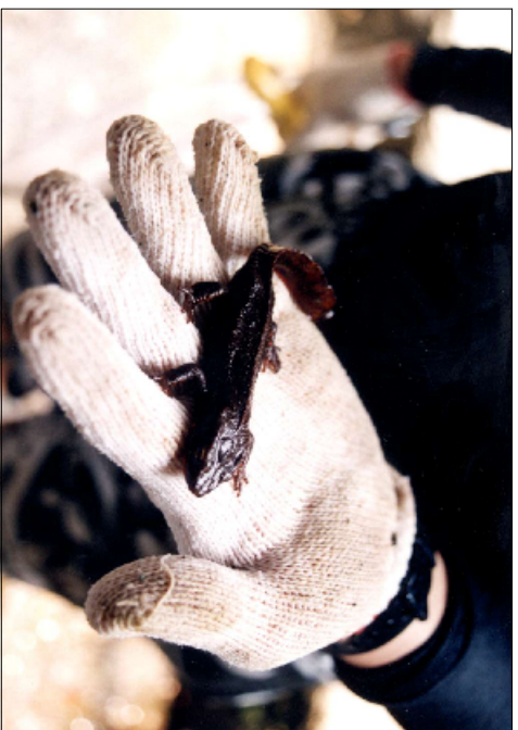
Hong Kong Newt (dorsal surface) ( Paramesotriton hongkongensis )