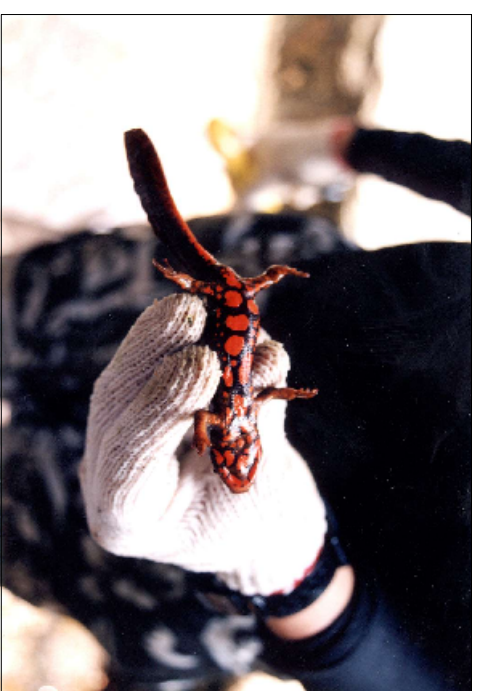
Hong Kong Newt (ventral surface) ( Paramesotriton hongkongensis )