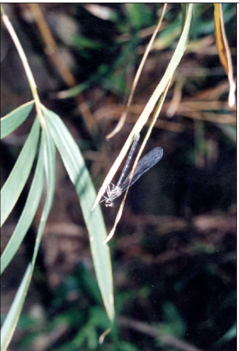
Damselfly ( Euphaea decorata )