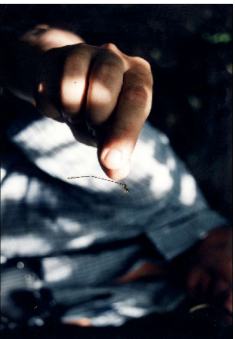
Damselfly ( Protosticta beaumonti )